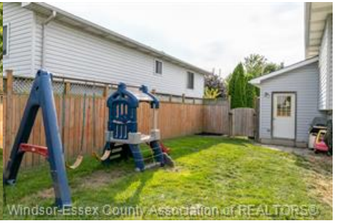
Windsor-Essex County Association of REALTORS®