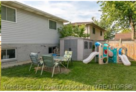
Windsor-Essex County Association of REALTORS®