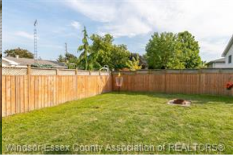
Windsor-Essex County Association of REALTORS®