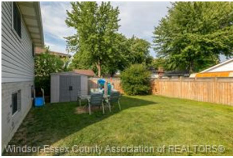
Windsor-Essex County Association of REALTORS®