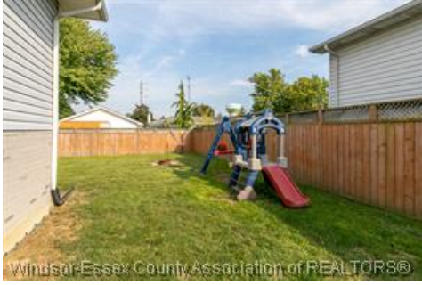
Windsor-Essex County Association of REALTORS®